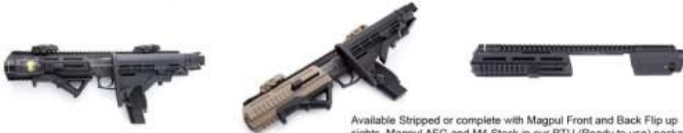
Available Stripped or complete with Magpul Front and Back Flip up sights, Magpul AFG and M4 Stock in our RTU (Ready to use) package.